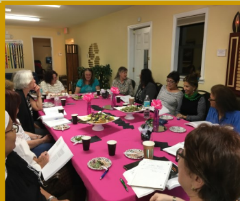
Ladies of the Rosh Chodesh Society learned all about the Feminine energy of Shabbat this month.