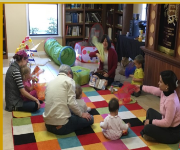
Babyccino babes and their parents sang, danced and played with Jewish themes such as creation and Purim this month.