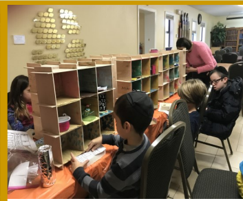
CHS students worked on their Jewish homes while learning about all the Mitzvahs we do in various rooms of the house.