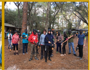
CTeen of Bradenton & Lakewood Ranch went Paintball Shooting for their CTeen Protect & Defend Event.